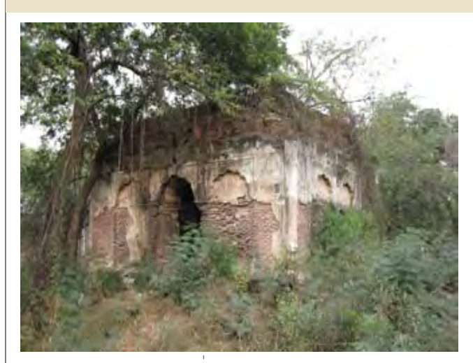
Garden Pavilion in 2008 before conservation